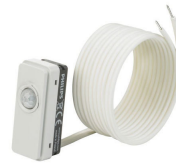
LRM8119/00 Lum Based Ext Sensor with LCA8004/00 COVER