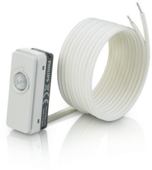
LRM8119/00 Lum Based Ext Sensor with LCA8004/00 COVER