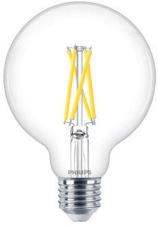
LEDclassic 60W G93 E27 CL WGD90 1PF 4 1