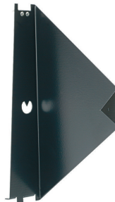
Simple aiming device