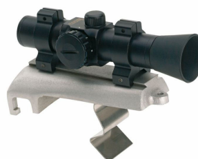
Zařízení pro přesné zaměření